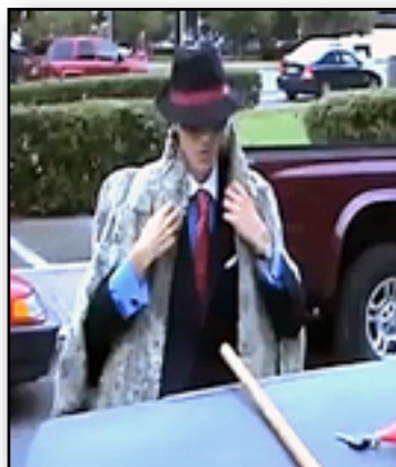
James O'Keefe , the “attack film maker” known for deceptive editing of video footage.

One of ACORN's most important projects was to help voters register—especially minority and disadvantaged voters. In other words, the kind of voters that are more likely to vote Democrat than Republican. So Republicans decided ACORN had to go.