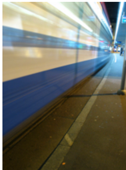
High Speed Rail Transportation

This will also reduce government revenues and tend to increase demand for additional spending on social programs, such as unemployment compensation. Thus, much of the supposed benefit from a reduction in the deficit will be lost, output will fall, and unemployment will rise. This is not necessary.